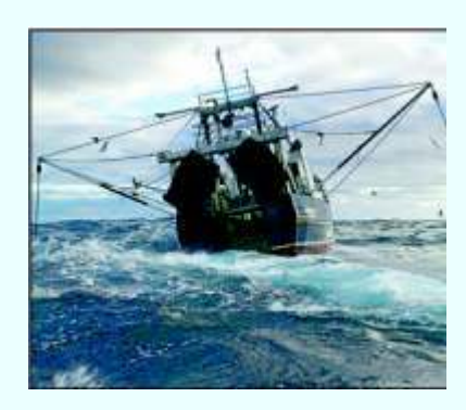
Lack of clarity: Allocation of quota rights is one of many tricky issues for the fishing industry.

"The fundamentals of our fisheries are sound. Now is the time to build on them for the future." he said.