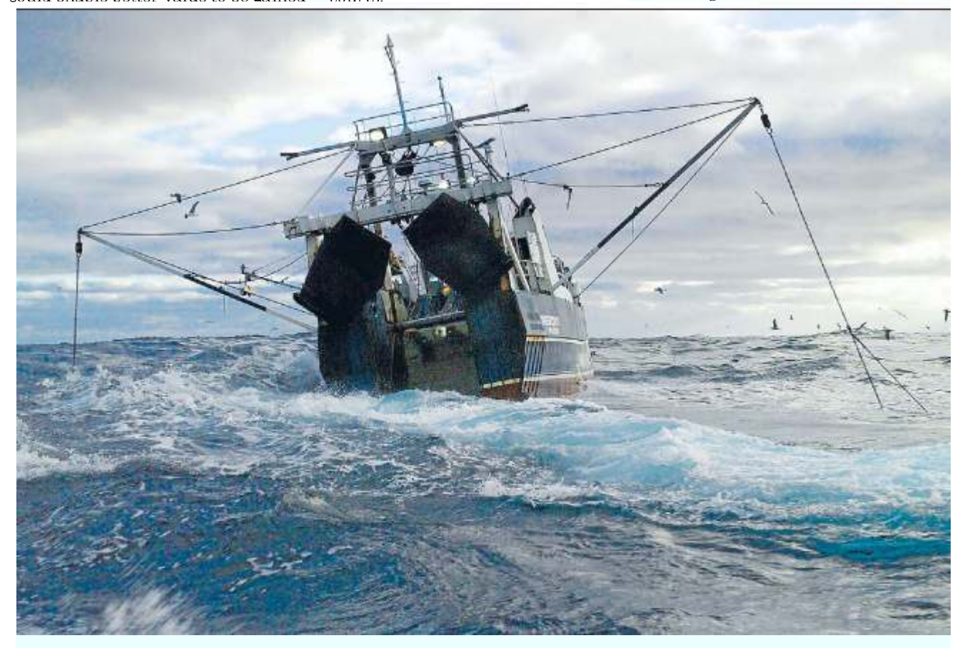
Lack of clarity: Allocation of quota rights is one of many tricky issues for New Zealand's fishing industry

Problems with public perceptions of fisheries and fishers, and the poor "brand" for commercial fishers. had resulted in low-quality debate. There had been practical difficulties reforming aquaculture management, partly because investors were uncertain about the high standards set for fish farming compared with land-based agriculture.